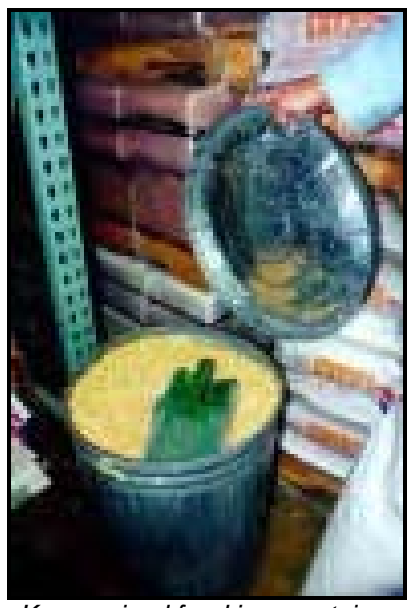
Keep animal feed in a container with a tight lid