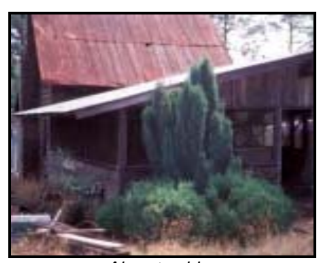
Air out cabins