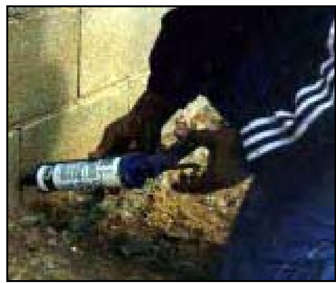
Seal holes with caulk