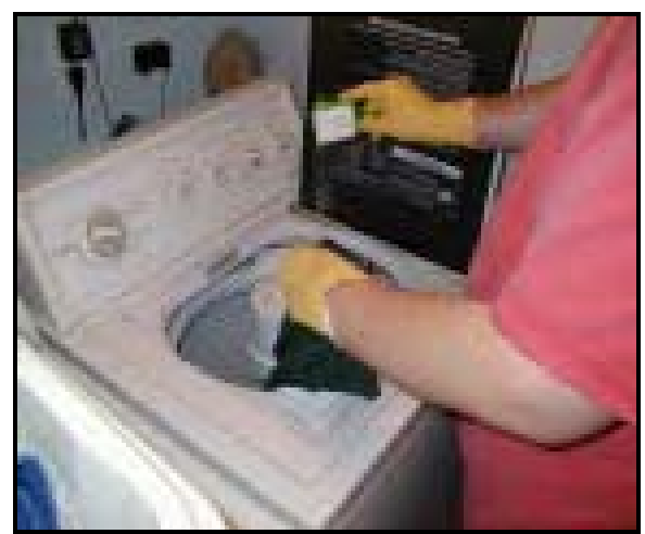
Wash clothes and bedding with detergent in hot water