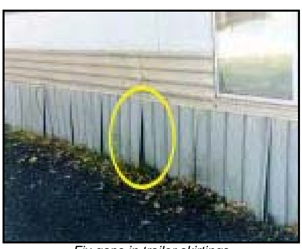
Fix gaps in trailer skirtings