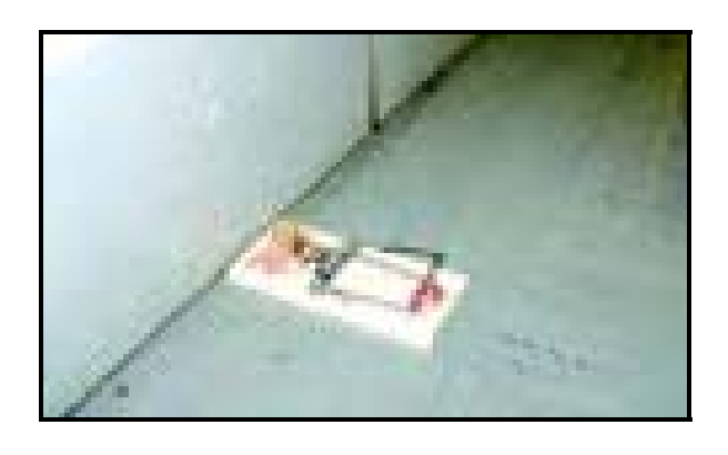
Place trap so it makes a "T" with the wall