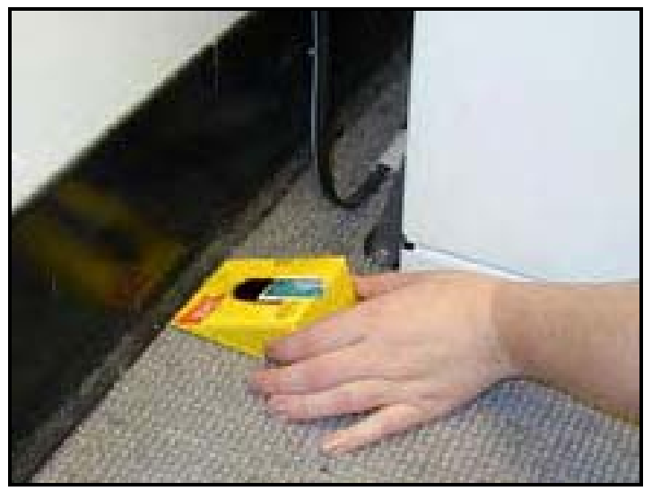
Place bait where you have seen mice or rats