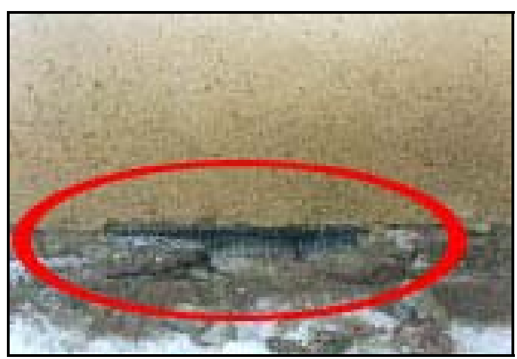
Fold lath metal and place in holes in the foundation of houses