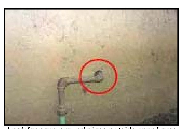
Look for gaps around pipes outside your home