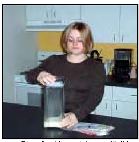
Store food in containers with lids.

Inside your home, use snap traps baited with peanut butter.