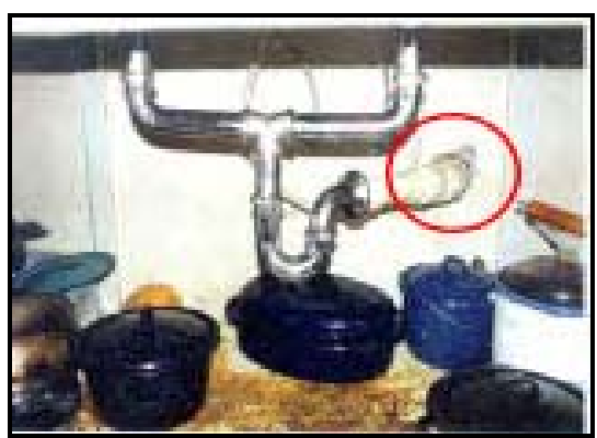
Look for gaps where the water pipes come into your home