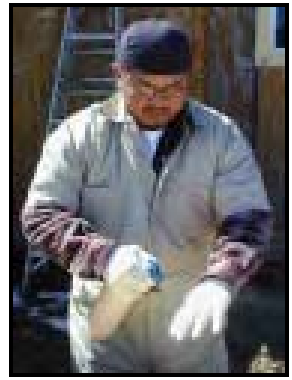
Spray gloves before taking them off