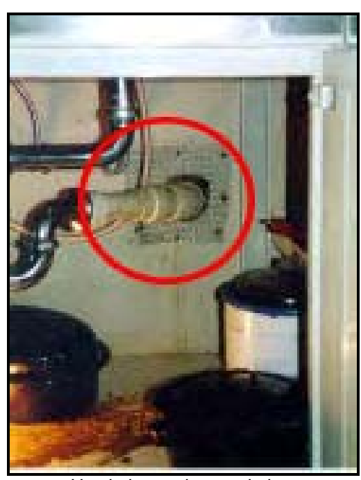
Use lath metal around pipes