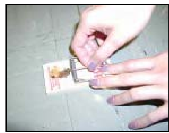
Use peanut butter on traps.