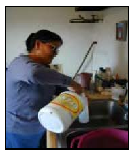
Bleach and water solution

Do not sweep or vacuum up mouse or rat urine, droppings, or nests. This will cause virus particles to go into the air, where they can be breathed in.